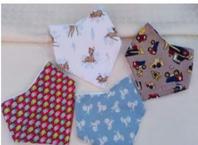
Toddler bandanas with toweling backing and adjustable neck with two metal poppas.

Email: sallyshomefootcare@gmail.com Tel: 01787 461753 or 07952 961694 Old Farm Barn, Little Maplestead Road, Essex CO9 3AR