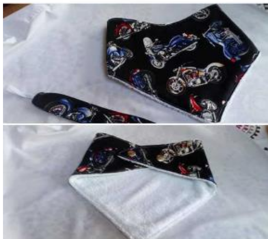
Just finished this order for a bandana with matching dummy clip.