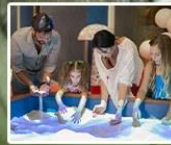
Duck undercover and build volcanoes at DISCOVERY DEN.