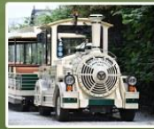
Take a JOURNEY on our Lost Madagascar Road Train...

*Offer valid from 1st January - 16th February 2024. Price dependant on day of visit. Ts and Cs apply.